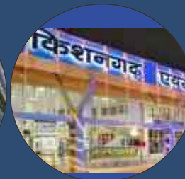
Kishangarh International Airport