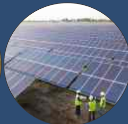
Ultra Mega Green Solor Power Project Cost Approx. Rs. 30,000 Crores