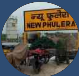
New Phulera DMIC Junction Cost Approx. USD 100 Billion