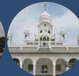
Gurudwara Sri Charan Kamal Sahib, Naraina