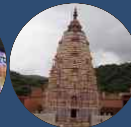
Shakambari Mata Temple